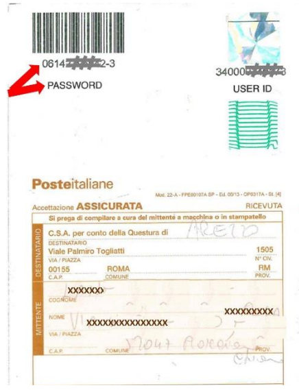
Figura 2 The receipt

Students must request the renewal of the residence permit for the entire year, starting within sixty days before the expiration date of previous residence permit.