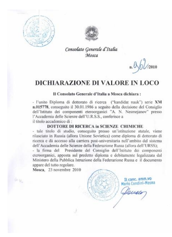
Figura 1 Dichiarazione di Valore

"Dichiarazione di valore" or the Declaration of Value is a document, issued by the competent Italian authority in the country to which the education system of your school refers, which certifies the validity of your Diploma and in particular certifies that you have the right to enter the Italian University. To obtain the Declaration of Value, contact the Italian Consulate in your country.